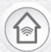
SMART HOME SYSTEM