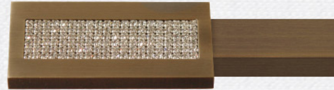
Put on rectangle finial